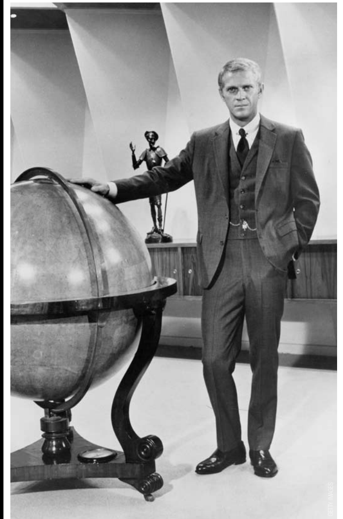
Three-piece Glen plaid suit in homage to Thomas Crown by Timothy Everest (www.timothyeverest.co.uk); cotton shirt with French cuffs, woven silk tie, and silk pocket square, all from Charvet; sunglasses from Persol, all property of The Rake .